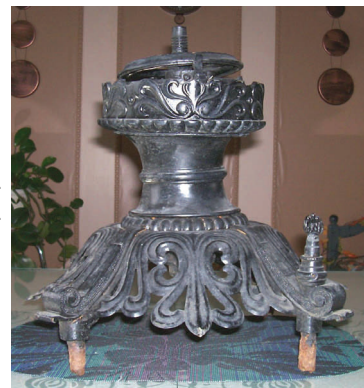
A brass gas lamp (lamp suspended in a passenger car that fell into Long Lake due to a derailment in 1918).