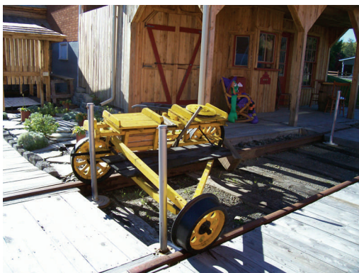
A velocipede dating from 1910 (a tricycle used for rail inspection)

Among the pieces donated in 2010, two really got our attention: