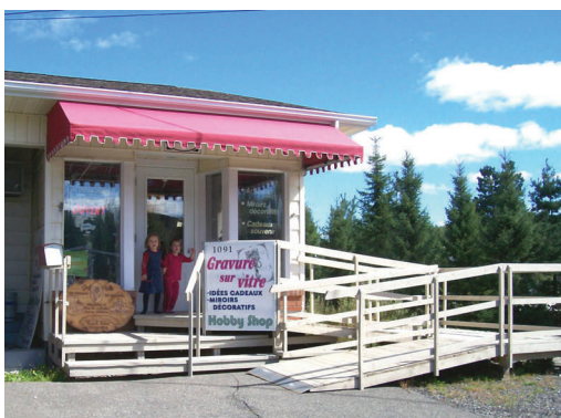
In order to assist our boutique clientele, an access ramp was added to the already existing front steps. It was the only location at the site that had not received that accommodation.