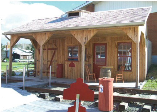
Because our 2010 theme was the passenger train, we built a small village station façade. It is an 1850s replica.

Next to the station, we created a completely recycled garden that allows people to leave a temporary mark of the time they spent with us. It is comprised of house foundation scrap, stoneware drainage pipes used as flower pots, plants that have been transplanted and hand-crushed stone.