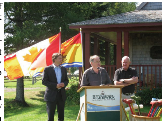
Official Grand Re-Opening of the Bonar Law Common 12 August 2010

Email: bonarlawcommon@nb.aibn.com Website: bonarlawcommon.com