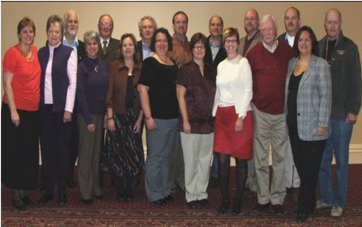
2009-2010 AMNB BOARD MEMBERS