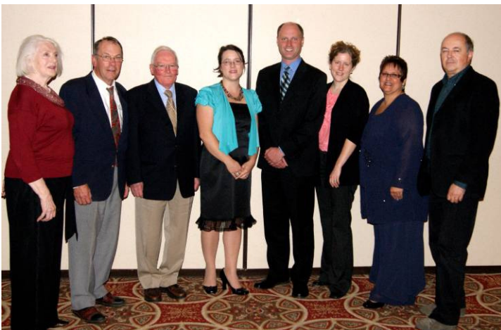
PHOTO GALLERY of AWARD WINNERS 2011