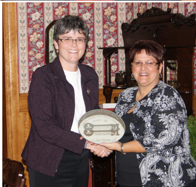
PHOTO GALLERY of AWARD Recipients 2012